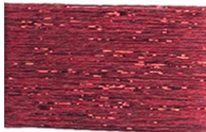
ROSSO 48/ RED