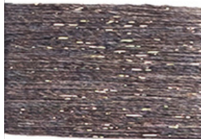
MORO MEL./ GOLD